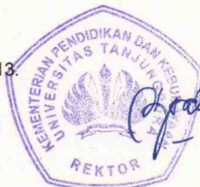
Universitas Tanjungpura Indonesia